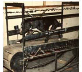
Training Equipment such as jenny / cat mills, spring poles, and treadmills with chains