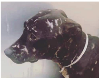
Dogs with multiple scars. Any breed can be stolen and used as a “bait dog”