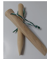
Break sticks for inserting in jaws