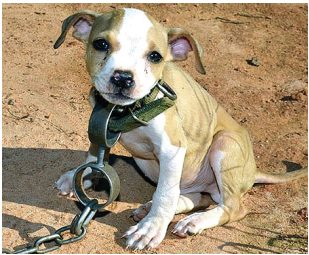
Dogs on heavy chains