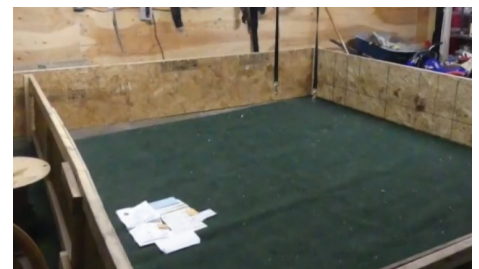
Fighting pits, often blood stained.

IF YOU WITNESS DOG FIGHTING IN PROGRESS, CALL 911